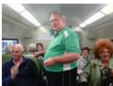
OUR LOLLYS MAN