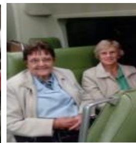
SOME OF OUR MEMBERS & FRIENDS IN THE TRAIN