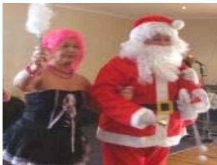
MRS CLAUSE COULDN'T MAKE IT SO SANTA CAME WITH HIE FRENCH MAID